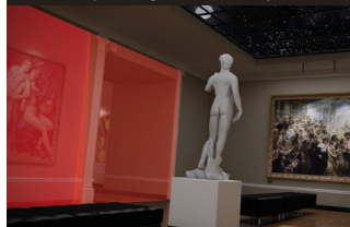
Day and night feature : « night »