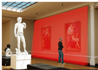
Protection of works of art