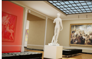
Day and night feature : « day »