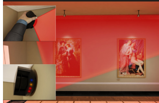
Protection against product damage and theft